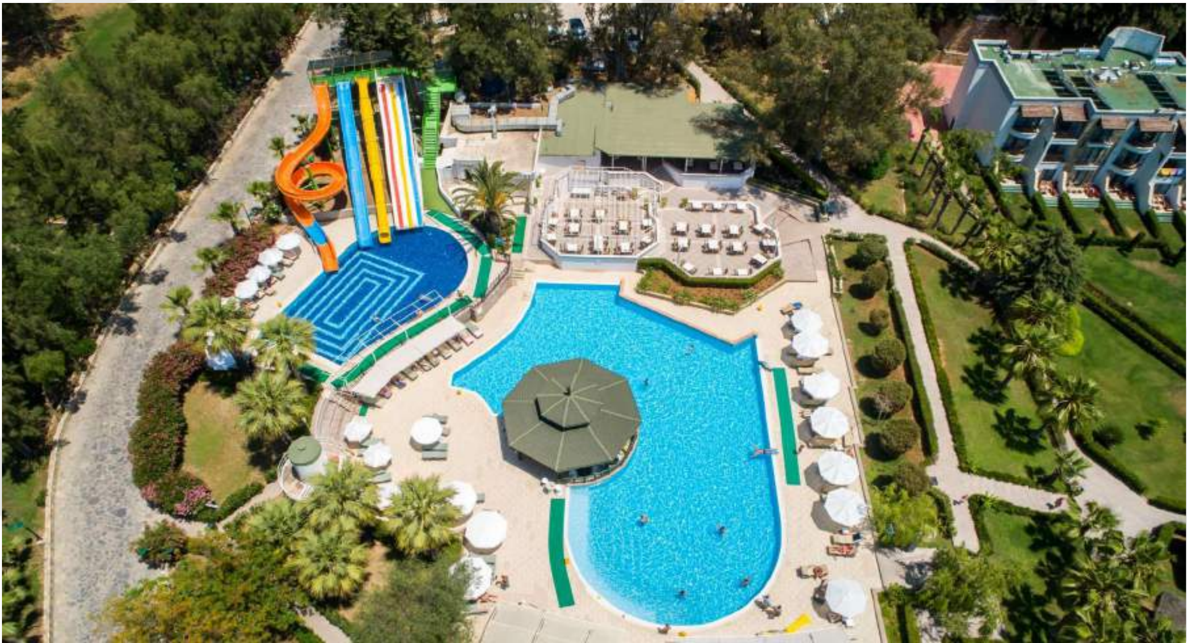
"Green Bay" Aquapark with an area of 500 m 2 is an exclusive facility, offering 4 types of slides.