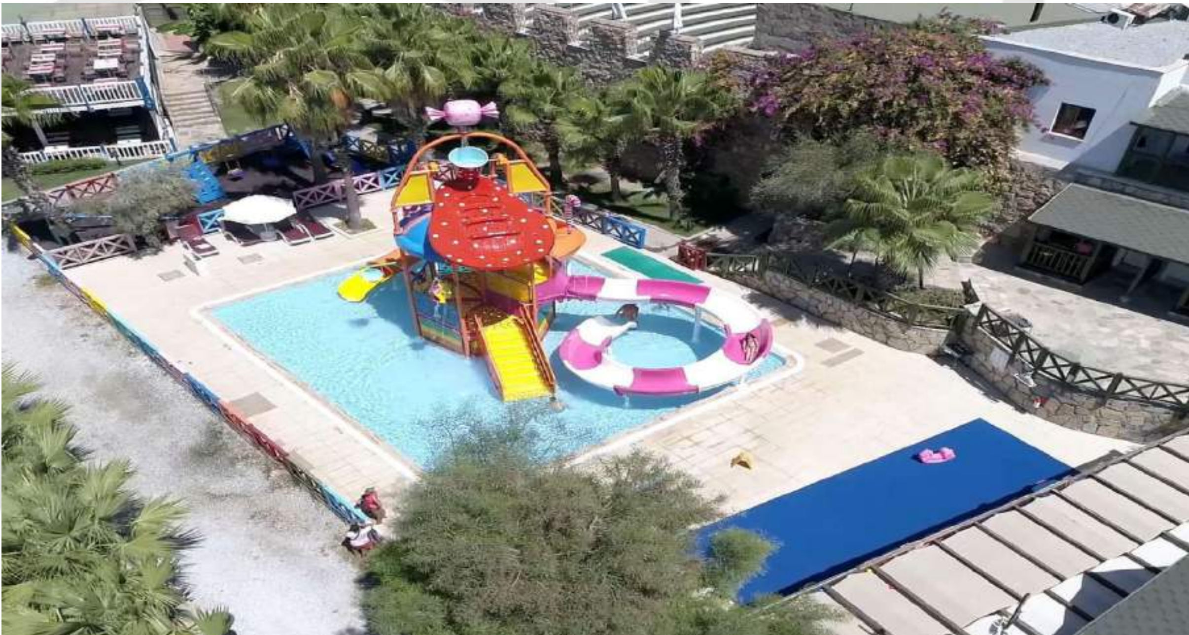
Aquapark concept available at the Mini Club area for little guests. Moreover, a renovated mini club and playground in 2022.